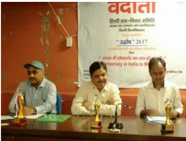
Prize distribution ceremony