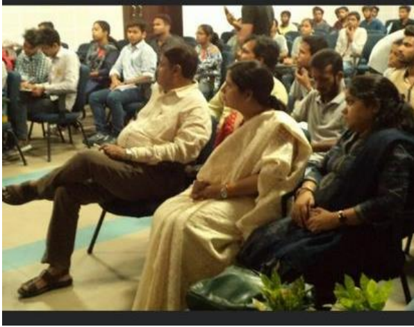
Participants during program