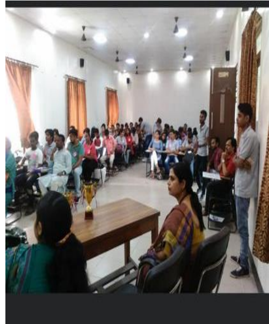
Interaction and Certificate distribution