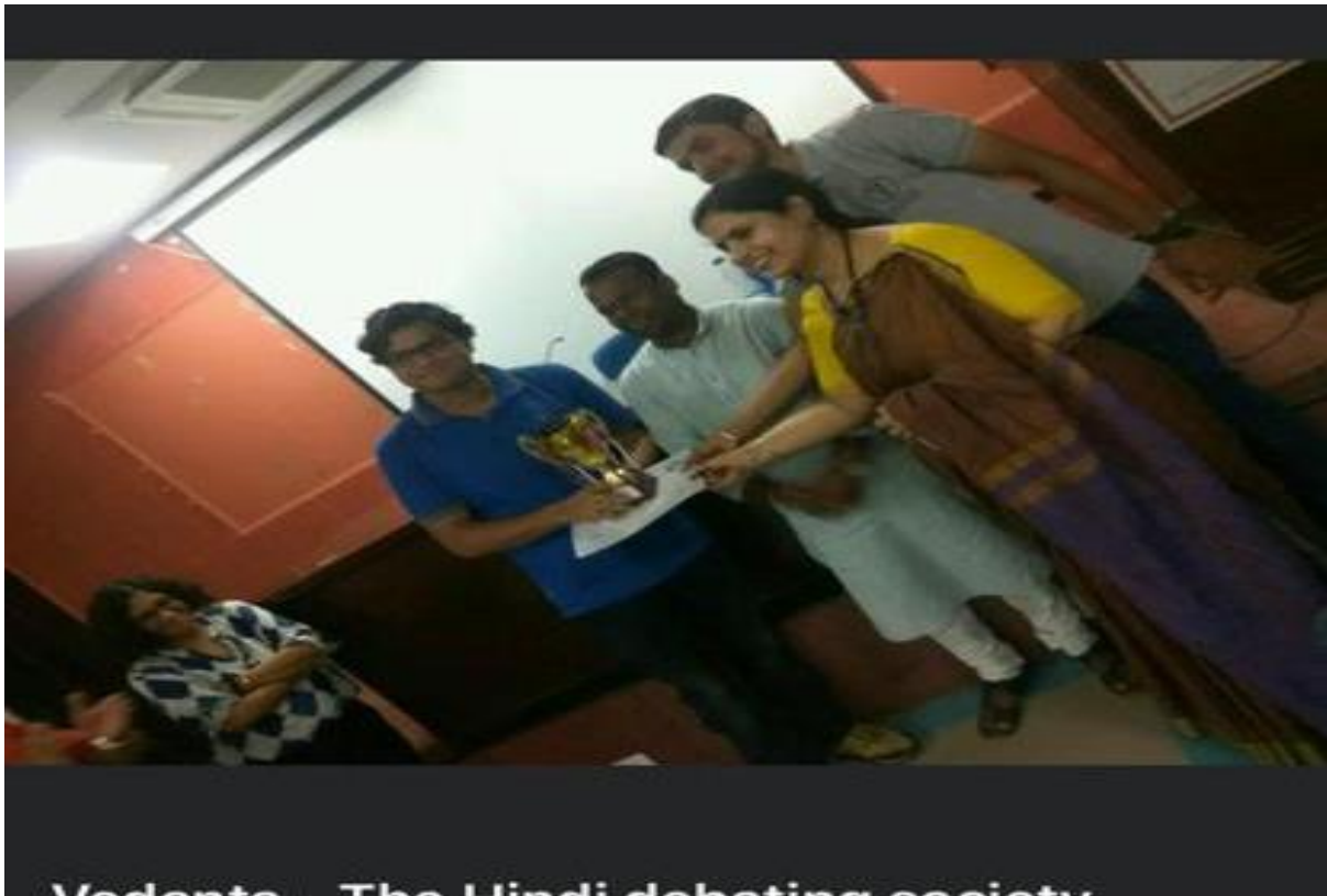
Prize distribution ceremony